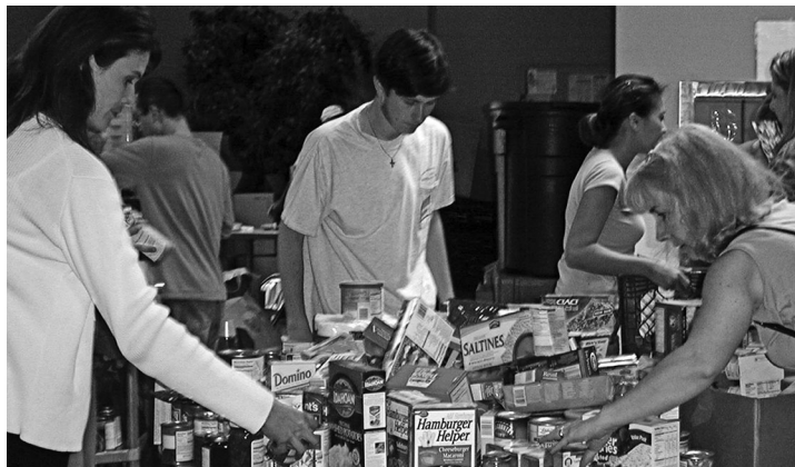
Faith Food Drive volunteers sort through more than 10,000 pounds of donated food and hygiene items in Caritas' Community Kitchen.

Special thanks to the Capital Area Food Bank for generously lending their scales for use in weighing the donated items.