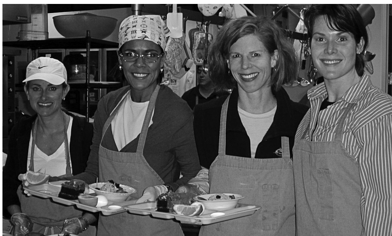
Junior League volunteers serve lunch to over 450 Community Kitchen diners.