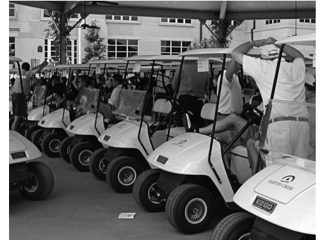
Golfers wait for instructions on the morning of June 8. The NAPA Celebrity Golf Classic was held at Barton Creek Resort and Spa's award-winning golf course.